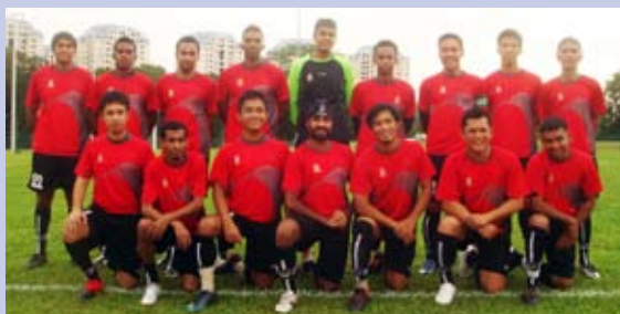
Our proud Tessensohn Khalsa Rovers

The SKA's participation in Football Association of Singapore National Football League Division 1 (April 2010 to September 2010)