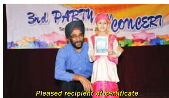
Pleased recipient of certificate

Both the events were successfully carried out. All pupils had an opportunity to showcase their talents.