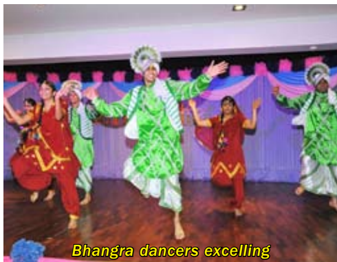
Bhangra dancers excelling

Singapore Khalsa Association wishes to place on record its heartiest thanks to the State Bank of India and Bollywood Taal for supporting this event.