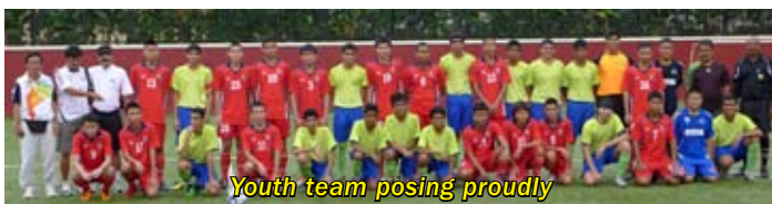
Youth team posing proudly