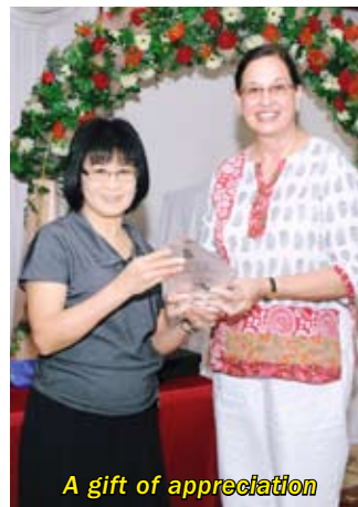
A gift of appreciation