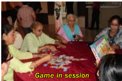
Game in session