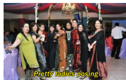
Pretty ladies posing