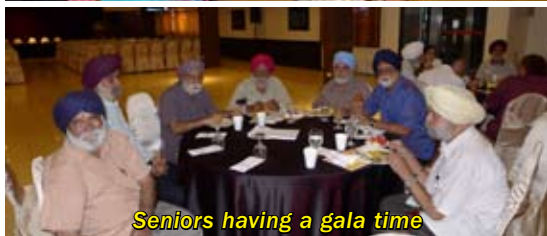
Seniors having a gala time