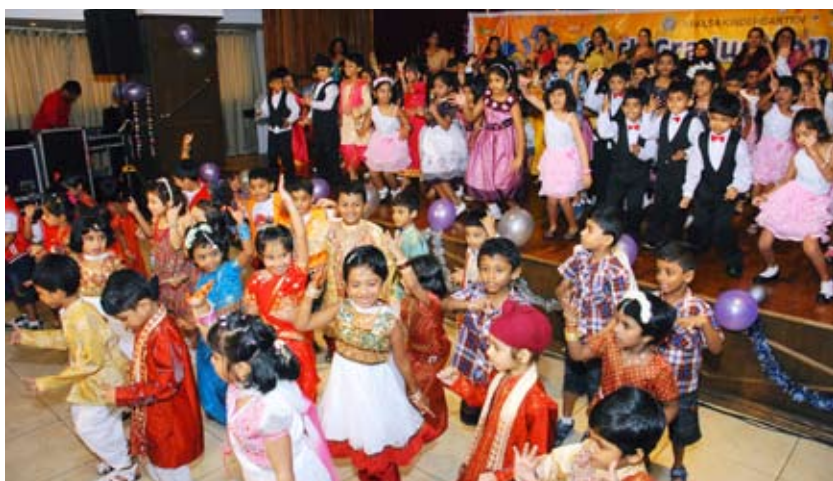
Performances by pupils