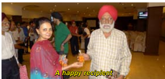
A happy recipient

The Singapore Khalsa Association's 65th Annual General Meeting, attended by 81 members, was held on Saturday, 12th November 2011. A new Management Committee was returned unopposed.