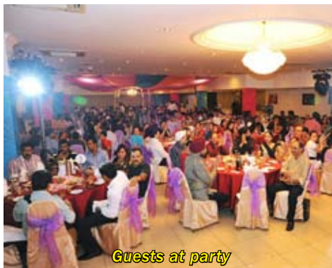
Guests at party