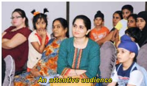
An attentive audience